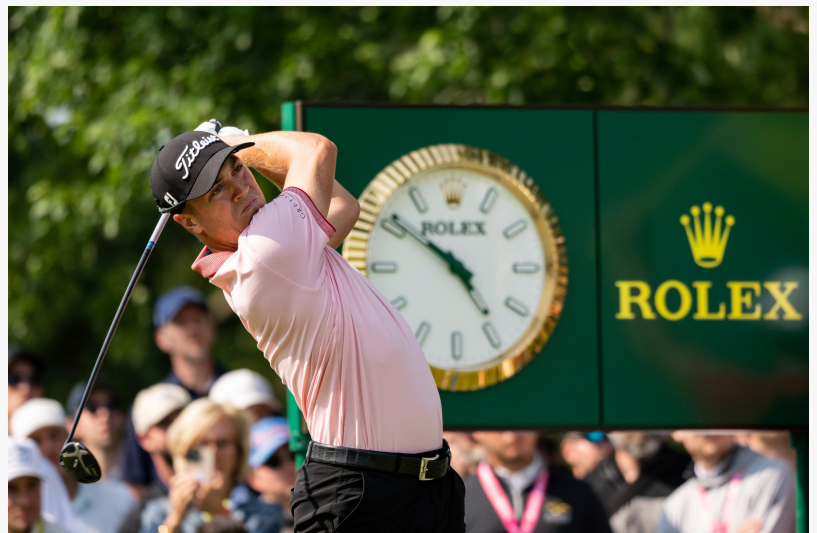
ROLEX TESTIMONEE JUSTIN THOMAS PLAYS A SHOT DURING THE FINAL ROUND OF THE 104TH PGA CHAMPIONSHIP