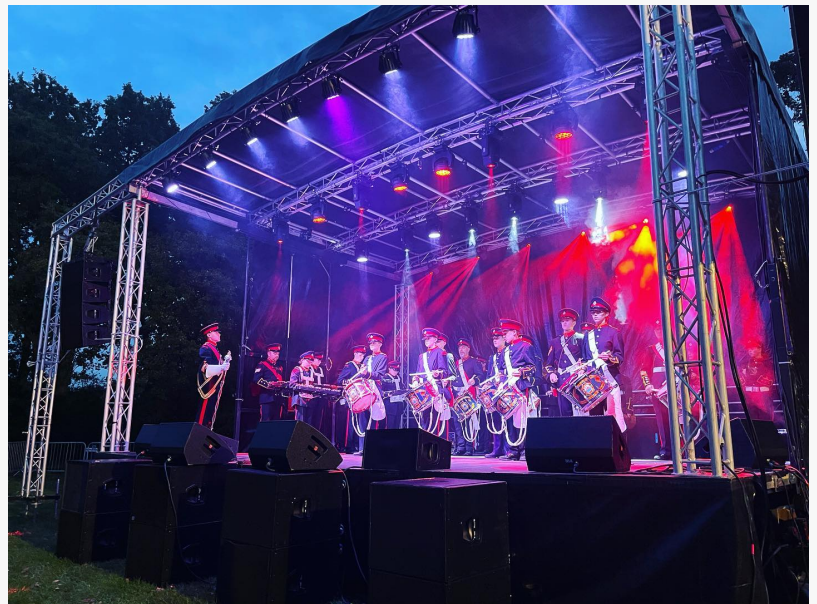
Outdoor mobile stage

Surrey Stage Hire Company Provides Stunning Production for King's Coronation