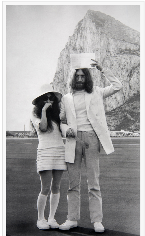
John Lennon and Yoko Ono Wedding Photo, Gibraltar, 1969