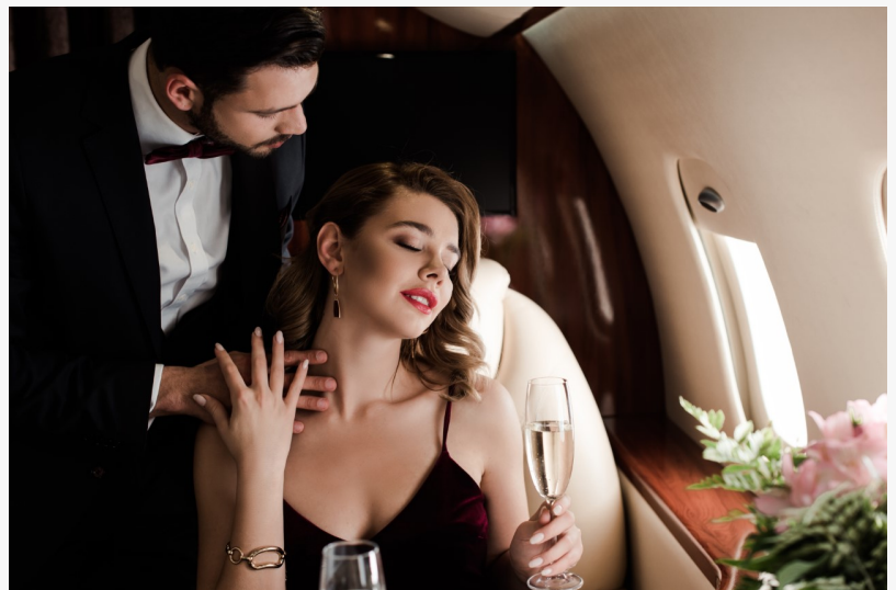
Let our experts find your match