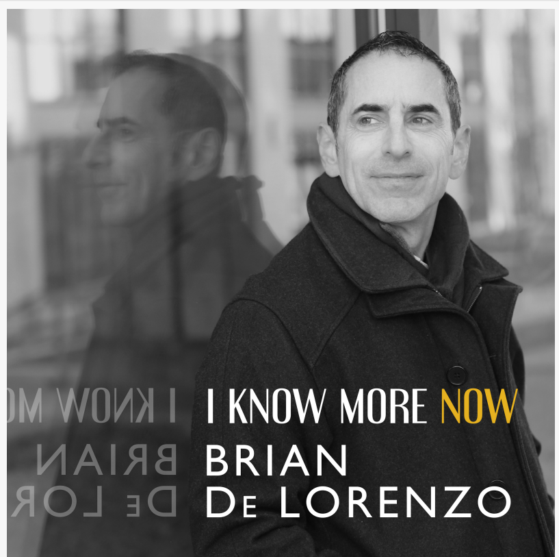
I Know More Now CD Cover Art.

This press release can be viewed online at: https://www.einpresswire.com/article/632806666