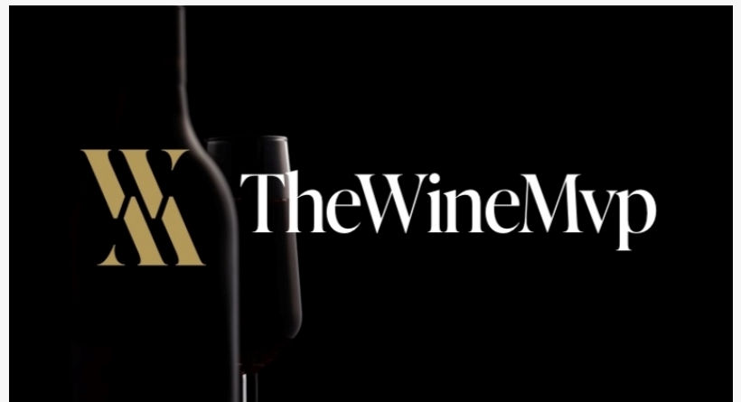
The Wine MVP Logo

"Wine is my passion, and I've loved sharing it with my community for the past five years. I'm excited to take that reach nationwide this year and share my expertise with everyone who