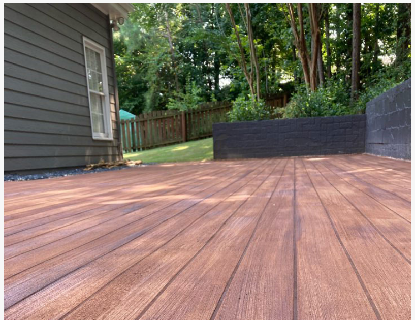
Rustic Concrete Wood residential patio

ATLANTA, GA, UNITED STATES, May 12, 2023 /EINPresswire.com/ -- In the world of decorative concrete coatings, Reeves Concrete Solutions has emerged as a leading name, providing exceptional craftsmanship and innovative solutions to transform ordinary surfaces into stunning works of art. With a string of recent successes, this Atlanta-based company has been making waves in the industry, securing high-profile clients and solidifying its reputation as a premier provider of decorative concrete coatings in the Atlanta area.