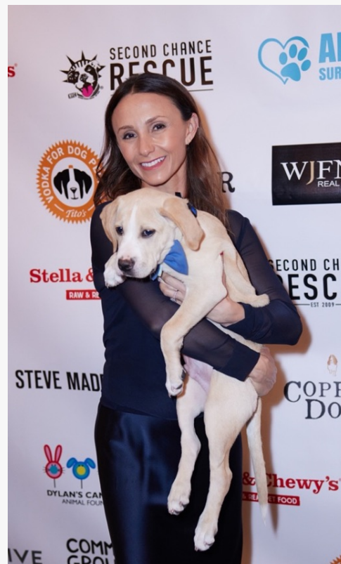
Georgina Bloomberg