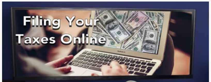
Filing Taxes Online