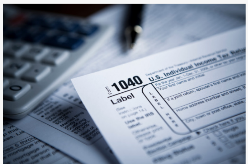
Where to Find IRS 1040 Forms

These updated 1040 instructions provide taxpayers with comprehensive guidance to help them