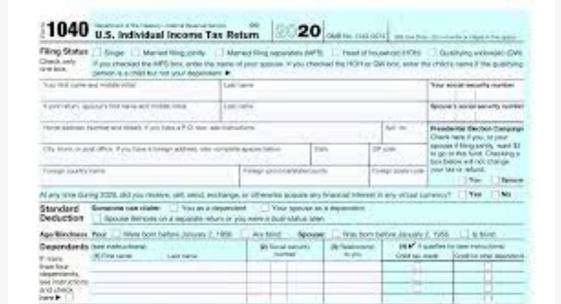
Printable IRS 1040 Tax Forms