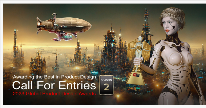
2023 NY Product Design Awards S2 Call for Entries

IAA had brought on numerous industry professionals to be jurors, with the intention of guaranteeing impartiality and enforcing strict standards of assessment. The jury was tasked with identifying stellar works amongst the submissions, and to honor these works with an award and recognition, in the hopes that by doing so it would elevate the industry's benchmark of excellence. IAA also received nominations from prestigious professionals for consideration as jurors.