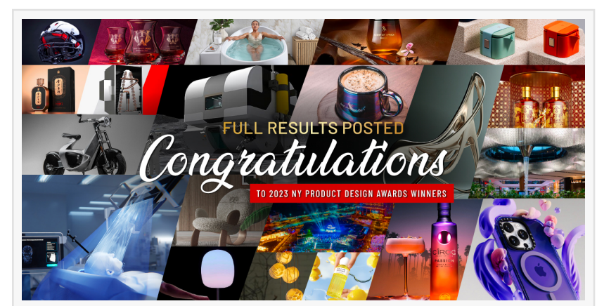
2023 NY Product Design Awards S1 Full Results Announced

NY, UNITED STATES, May 18, 2023 /EINPresswire.com/ -- The New York Product Design Awards wrapped up its first competitive season for 2023 and its winners have been announced. Out of over 850 entries submitted, the competition had determined winners by examining the submitted works and how they improved people's daily lives.