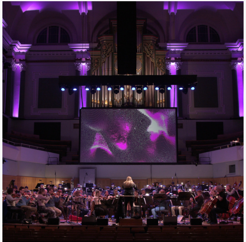
National Concert Hall, Dublin with Audiotek and L-Acoustic design in action.