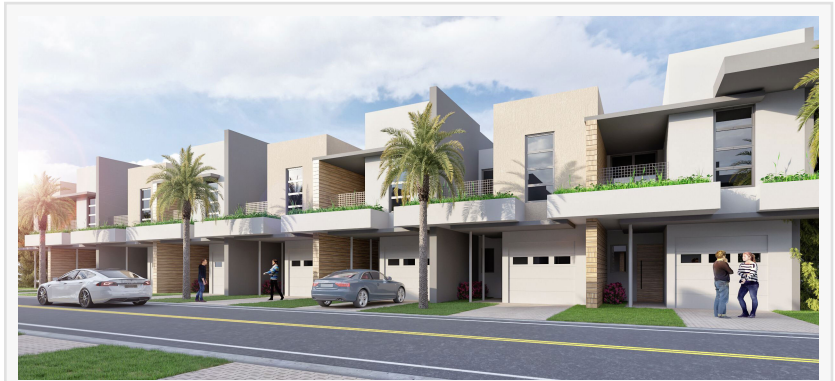
Artist Townhomes Pre-construction Condos Exterior View

The development is only 8 minutes from Ft. Lauderdale International Airport, 4 minutes from the I-95 interstate highway, and a mere 4 minutes from the breathtaking Hollywood Beach, boardwalk, and Atlantic Ocean. In addition, it is within walking distance of the vibrant Artist Circle, a hub of art, dining, and nightlife.