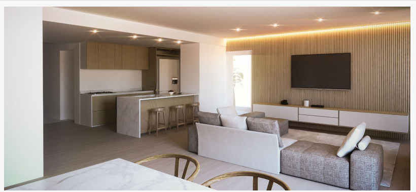
Artist Townhomes Living Room and Modern Kitchen

Artist Townhomes is a pre-construction luxury townhouse development in Hollywood, Florida, offering a unique investment opportunity with no rental restrictions and a potential 20% return on investment through Airbnb. Designed by a world-class architect, each townhouse features 3 bedrooms, 2.5 bathrooms, and modern, high-end finishes. Centrally located near the airport, interstate, beach, and vibrant Artist Circle, Artist Townhomes is poised to become a sought-after destination for luxury living and short-term rentals in South Florida.