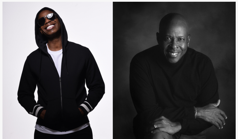
Doug E. Fresh (left) & David Porter