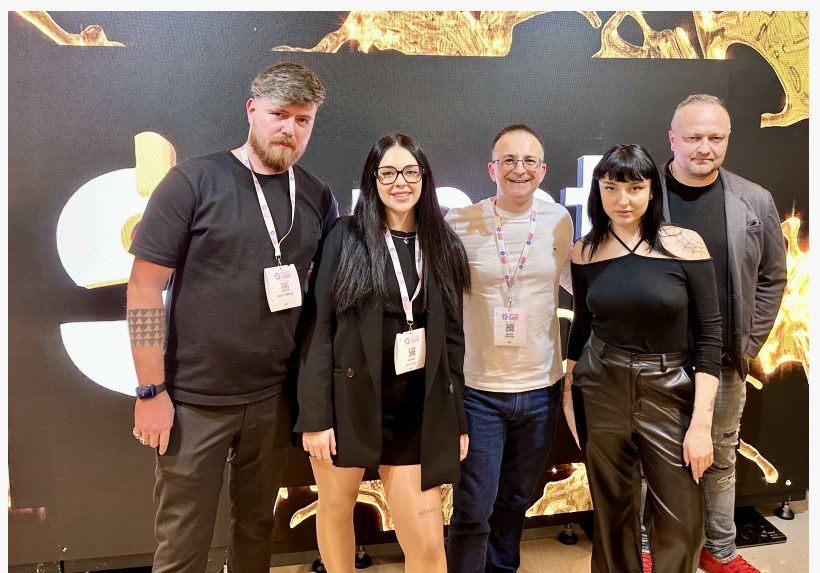
metastudio team at cryptoexpoeurope.com

This press release can be viewed online at: https://www.einpresswire.com/article/633209607