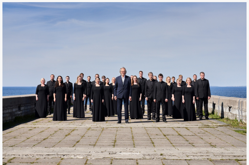
Estonian Philharmonic Chamber Choir

Grammy Award-winning Estonian Philharmonic Chamber Choir (EPCC) is one of the best-known Estonian music ensembles in the world. The choir, founded in 1981 by Tõnu Kaljuste, performs