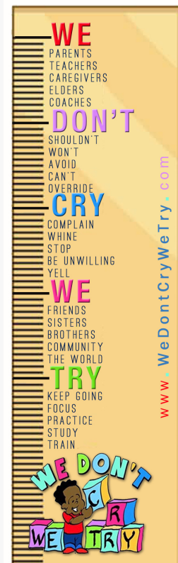
We Don't Cry, We Try Bookmark