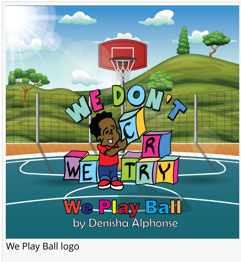
We Play Ball logo

Reading With Your Kids Podcast has certified the books in the We Don't Cry, We Try series as good reads. According to them, "It is a great-looking book that might help you navigate emotions with your kids." In addition to providing a great way to manage your child's urge to cry and understand the situation with the catchphrase "We Don't Cry, We Try," the book also encourages parents to talk and address the problem at the right time to acknowledge their child's feelings and show empathy.