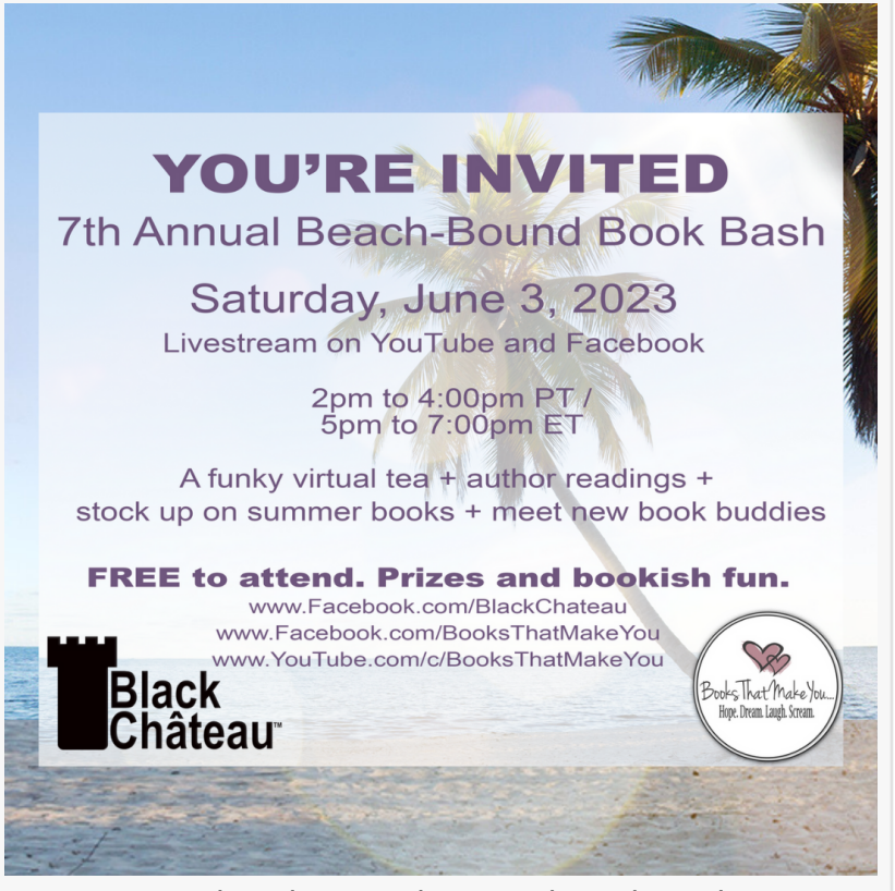
You're Invited to the Beach-Bound Book Bash 2023