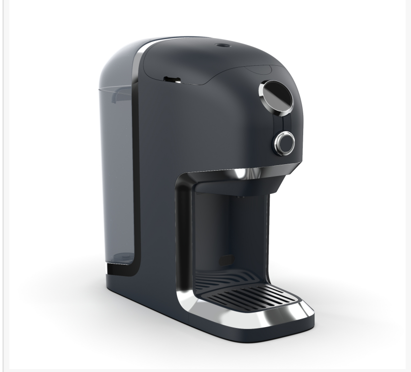
BRU Maker One Black/Chrome

Filip Carlberg BRU AG +46 73 322 72 01 fc@bru-tea.com Visit us on social media: LinkedIn