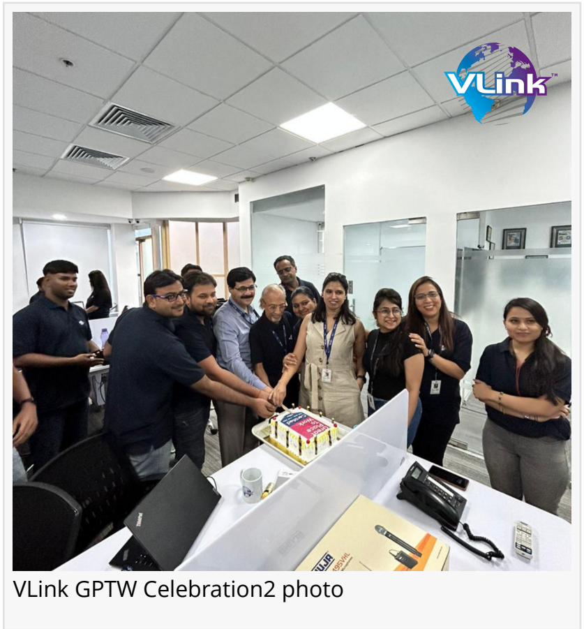
VLink GPTW Celebration2 photo

This press release can be viewed online at: https://www.einpresswire.com/article/633328200