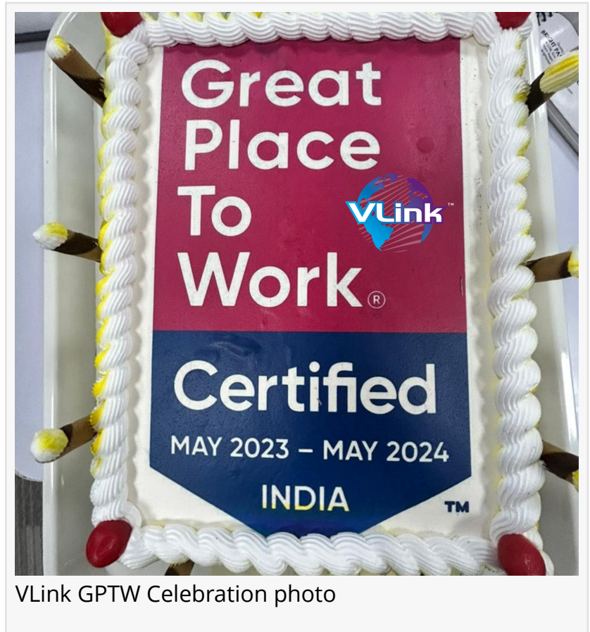
VLink GPTW Celebration photo

VLink Inc. is a global software engineering and IT staffing partner , delivering innovative solutions with the most highly vetted expert software development teams. We leverage the latest technologies and the best IT talent to drive business growth for Fortune-500, Large and SMB clients by delivering a customized, personal approach, to ensure their unique technology needs are met.