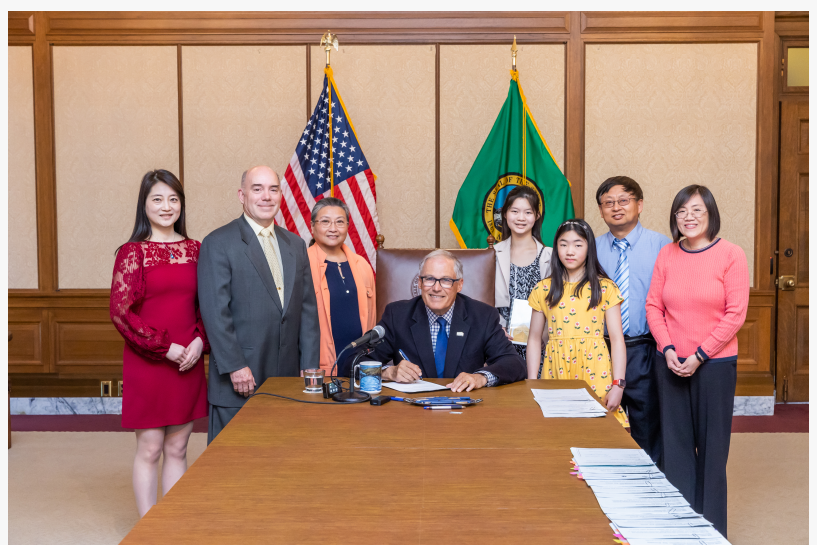
Gov. Inslee signs Senate Bill No. 5000, May 9, 2023. Relating to recognizing contributions of Americans of Chinese descent. Primary Sponsor: Sen. Wagoner

BELLEVUE, WA, UNITED STATES, May 15, 2023 /EINPresswire.com/ -- After a four-year struggle , Washington State finally established January as Americans of Chinese Descent History Month, which is the first in the nation. On May 9th, Governor Jay Inslee signed SB 5000, the Americans of Chinese Descent History Month bill, into law. The bill's prime sponsor, Senator Keith Wagoner (R-Sedro Woolley), along with some of the bill's longtime supporters and advocates, attended the bill signing. The new law will take effect on July 23, 2023.