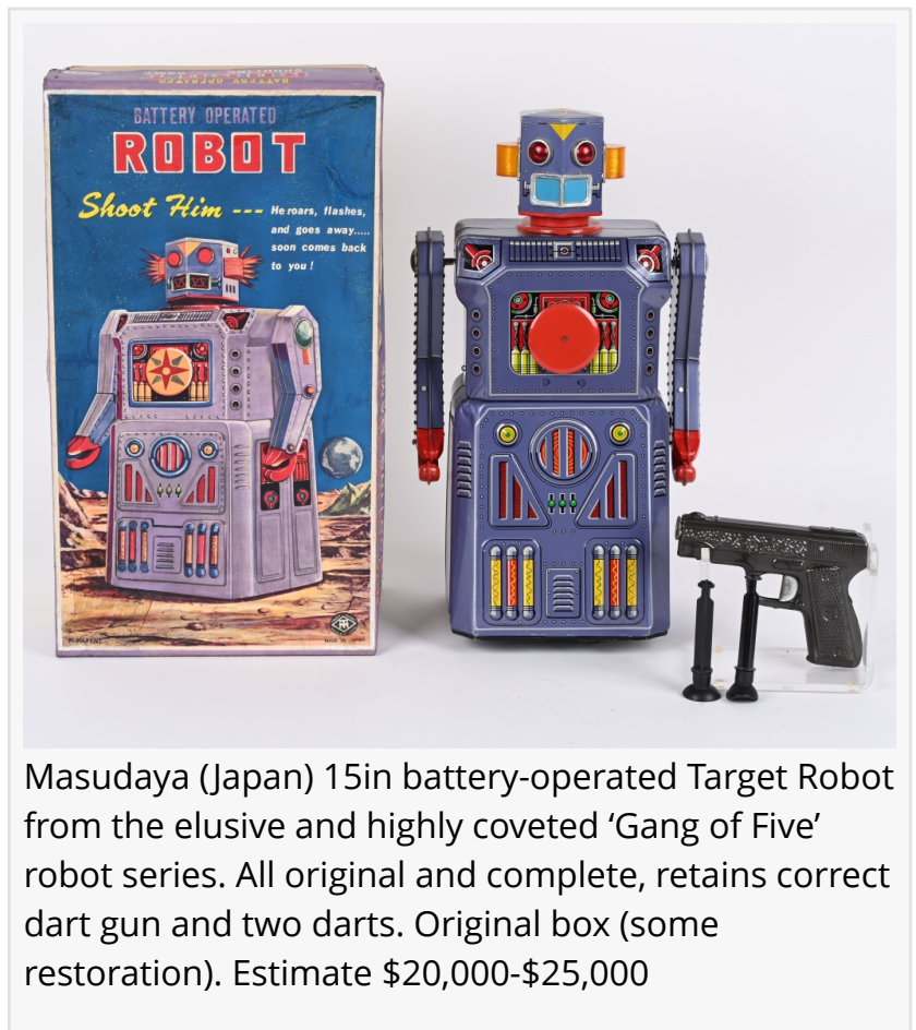
Masudaya (Japan) 15in battery-operated Target Robot from the elusive and highly coveted 'Gang of Five' robot series. All original and complete, retains correct dart gun and two darts. Original box (some restoration). Estimate $20,000-$25,000

"Gang of Five" robot series. It's unusual to encounter an example as clean, original and complete as the one offered by Milestone. Standing an impressive 15 inches tall and finished in glossy purple, red and yellow with a red circular target on its chest, it comes with its correct dart pistol and two darts. Even better, it retains its colorful original box, making it a top prize for any collection. Target Robot is ready for action and has a pre-sale estimate of $20,000-$25,000.