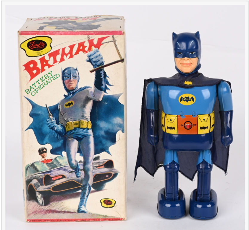
Nomura (Japan) battery-operated Walking Batman. All original, complete, appears never to have been played with. All functions in working order when tested. Original box with great graphics of Batman, Robin and Batmobile. Estimate $6,000-$8,000

WILLOUGHBY, OHIO, USA, May 15, 2023 /EINPresswire.com/ -- Today, many nations and private companies are engaged in the Space Race, but there's no contest as to who the winner is when it comes to space toys. Japan has been the clear and unchallenged leader in the manufacture of robots and space toys since the end of World War II. The imaginative designs of Masudaya, Yonezawa, Nomura and scores of other Japanese firms of the 1950s-1970s are revered by collectors who love the toys' fanciful looks and quirky actions, not to mention the wild artwork on their boxes. Milestone Auctions , the home of great toy collections, will offer a treasure trove of sought-after robots, space toys and dozens of other types of vintage playthings at their big May 27th Spring Premier Toy Sale.