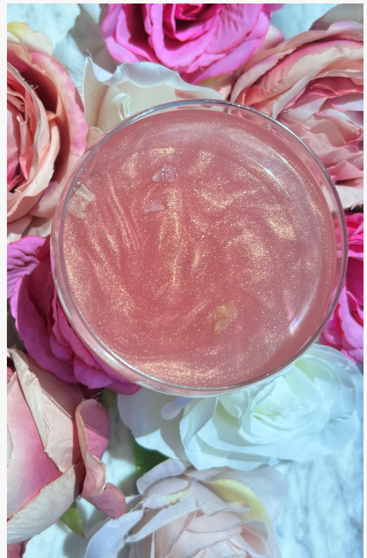
Cocktails with My Drink Bomb