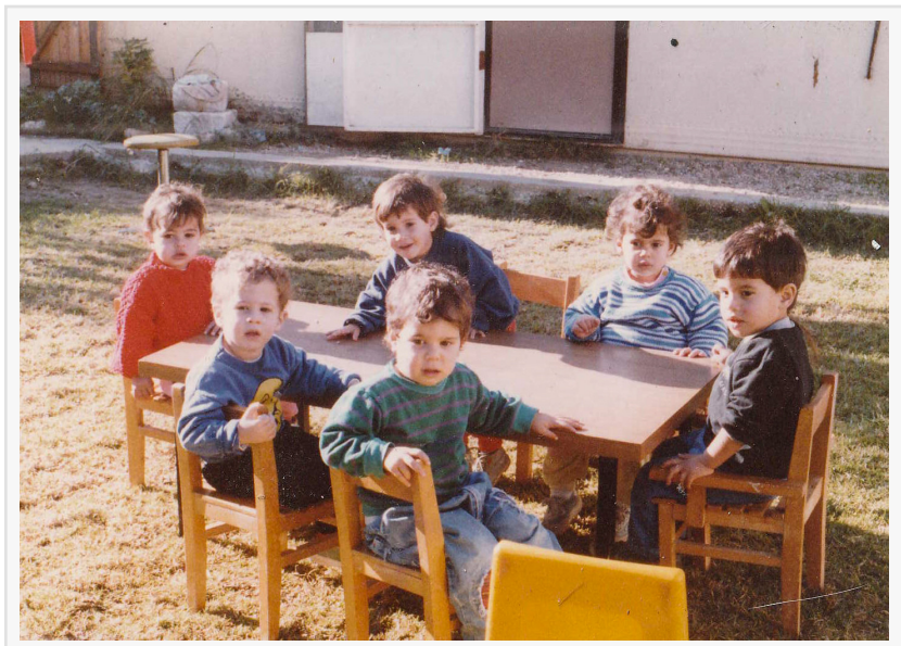
Scene from 'Children of Peace'