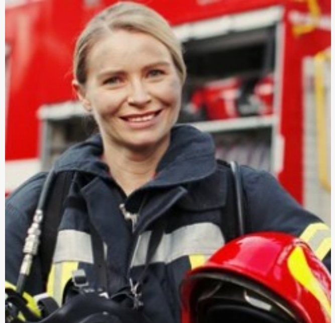
FD Backgrounds; the nation's first dedicated fire department background investigation service.

FD Backgrounds is staffed with experienced investigators who specialize in fire department background investigations . They have an in-depth understanding of the unique challenges that come with investigating fire department candidates. They use the latest tools and techniques to provide the most comprehensive reports, ensuring that human resources and command staff can make informed decisions when hiring new personnel. The comprehensive investigations are FCRA, ADA and Title VII compliant.