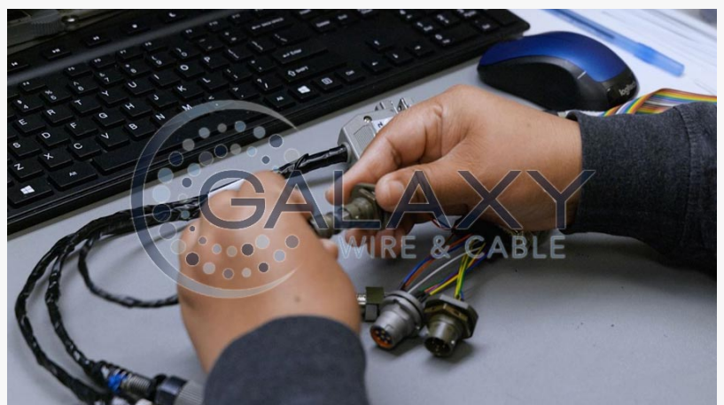
Continuity Hipot check

Galaxy Wire & Cable is a leading supplier and manufacturer of custom and stock wire and cable,