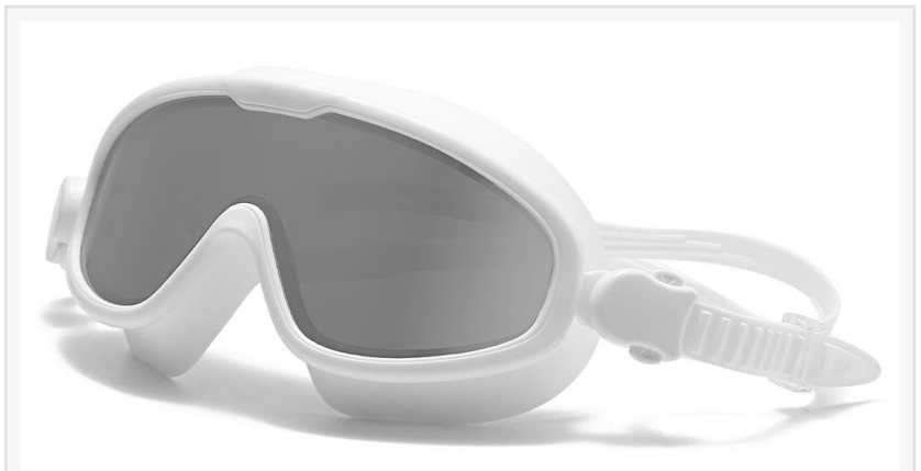
Calvin Swimming Goggle

surrounding frame usually made of silicon gasket. Its nose width cannot adjust since the frame and the nose bridge of such goggles are often one unit. Just like the name "leisure goggles", this type is viewed as one of the most comfortable goggles and served as the choice for beginner swimmers. With a rounded lens and better visibility, competition goggles have adjustable nose bridge, allowing wearers to choose from a single adjustable bridge to various bridge sizes. Because of the adjustable and flexible factor, competition goggles are more comfortable and can tolerate rougher water for those who have to swim for longer periods of time. As for swim masks, they are much bigger than other types of goggles and specially designed for scuba diving and snorkeling. They are not the most comfortable and softest type for swimming though, some recreational swimmers still prefer such style.