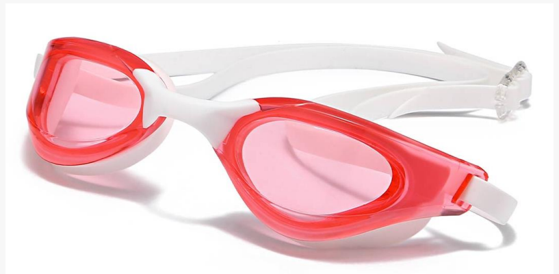
Ruby Swimming Goggle