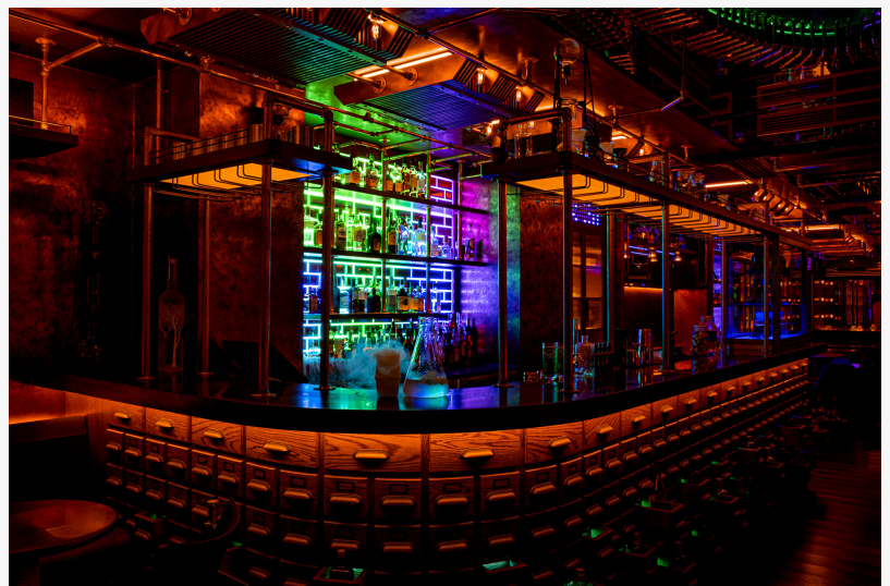
Hokus Pokus Alchemy Lab London