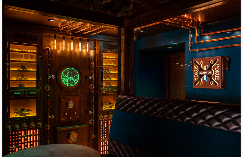
Hokus Pokus Alchemy Lab