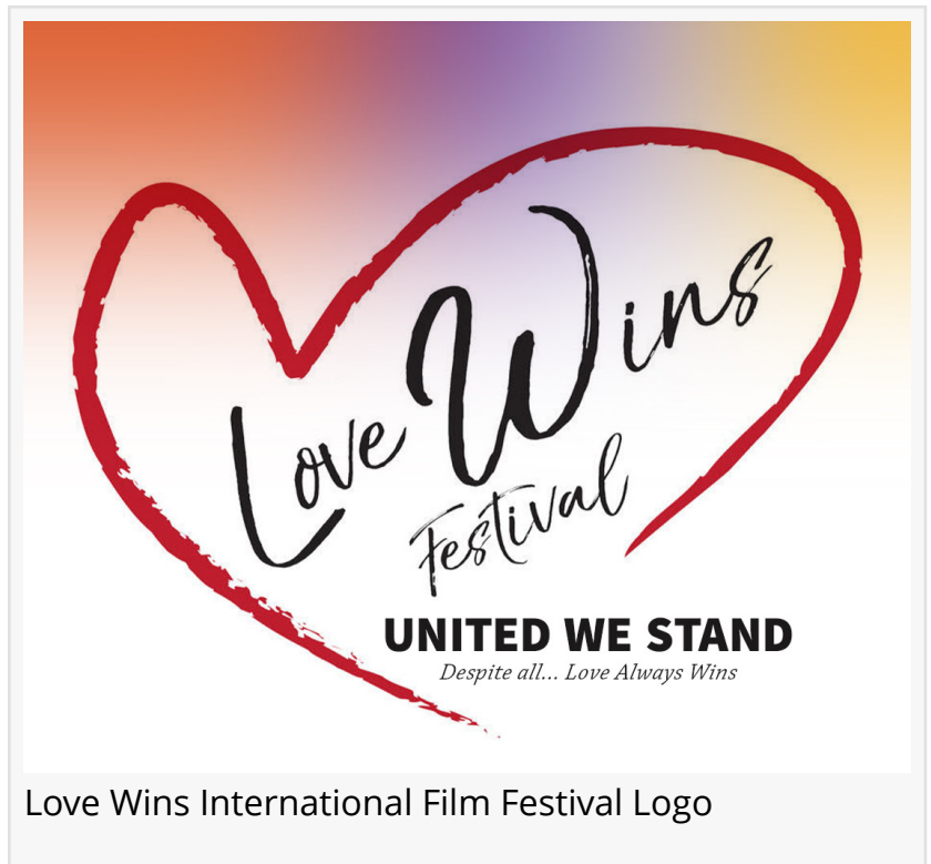
Love Wins International Film Festival Logo

are too often silenced. I'm proud to be a Long Island Native, in the LGBTQIA+ community and have Cherokee Indian bloodlines. The Film Festival is an exciting event that offers the chance to witness important films on the big screen, have healing conversations, and enjoy live performances, Art and Music in a beautiful Cinema that aligns with our mission of creating awareness for underrepresented Artists. See you on the Red Carpet! Despite All...Love Always Wins”