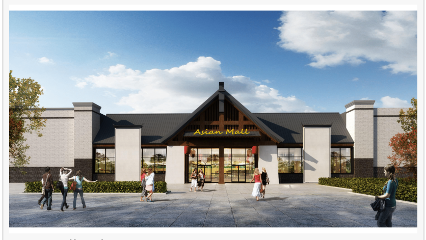
Asia Mall, Eden Prairie