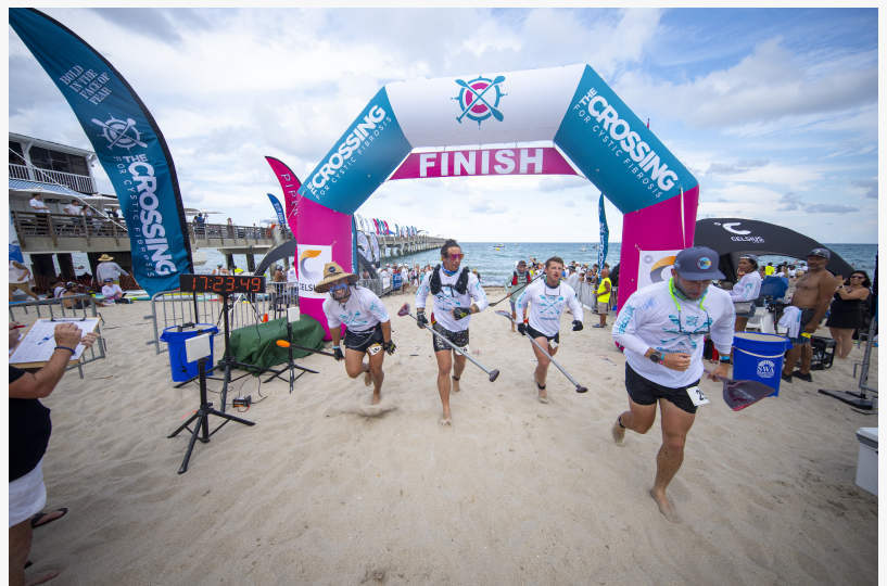
Finish line or The Crossing for Cystic Fibrosis