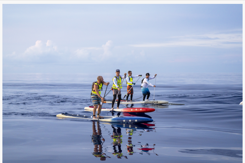
Paddlers in Crossing For Cystic Fibrosis