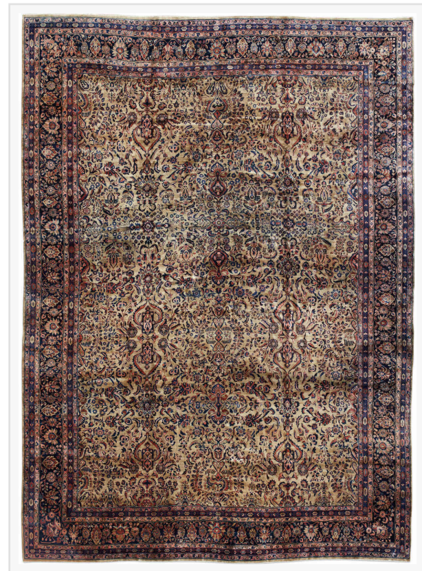
Central Persian Sarouk Fereghan carpet, approximately 22 ft 9in by 17 ft 8in (est. $20,000-$30,000).

The highly experienced staff has a wealth of knowledge with international savvy, having worked for many years at major international auction houses in North America and Europe, sourcing property from all corners of the United States. Andrew Jones Auctions' sales are diverse and eclectic, and feature fine diamonds to contemporary art, spanning from antiquity to today.