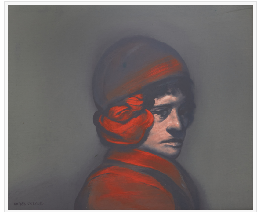
Oil on canvas painting by Rafael Coronel, titled Man in Red (est. $8,000-$12,000).

The Moldaws' collection also includes Asian and European furniture, such as a Chinese hardwood bench (est. $1,500-$2,000), as well as lacquer tables and an impressive gilt and black