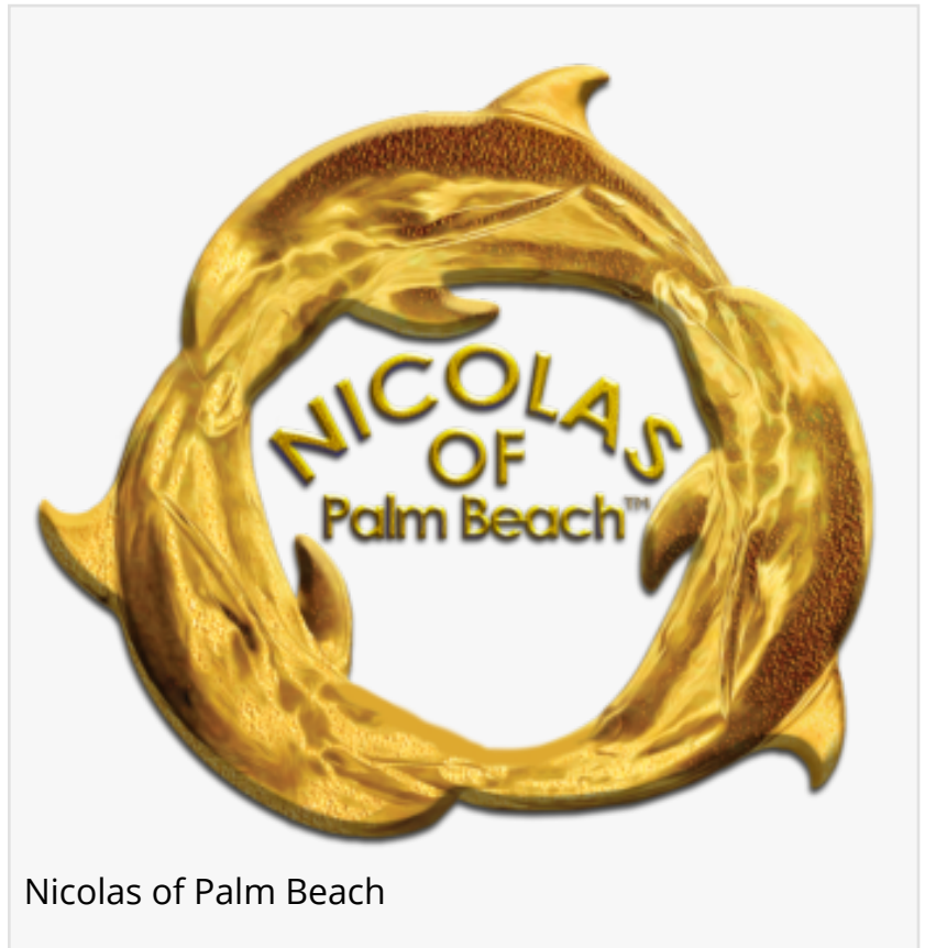
Nicolas of Palm Beach

or mother of pearl instead of diamonds and Paraibas in their signature designs are now under