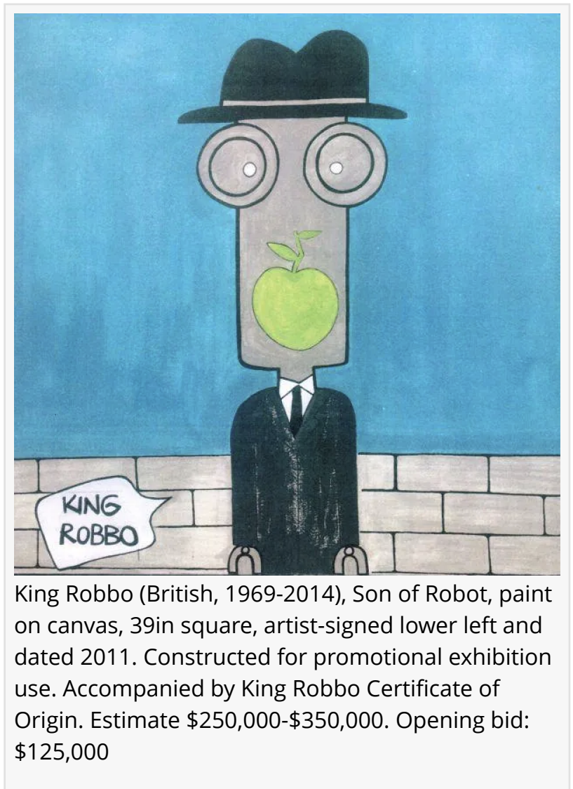
King Robbo (British, 1969-2014), Son of Robot, paint on canvas, 39in square, artist-signed lower left and dated 2011. Constructed for promotional exhibition use. Accompanied by King Robbo Certificate of Origin. Estimate $250,000-$350,000. Opening bid: $125,000