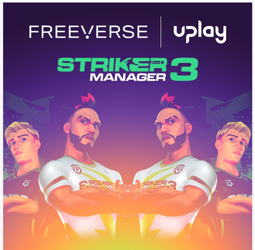
Striker Manager 3