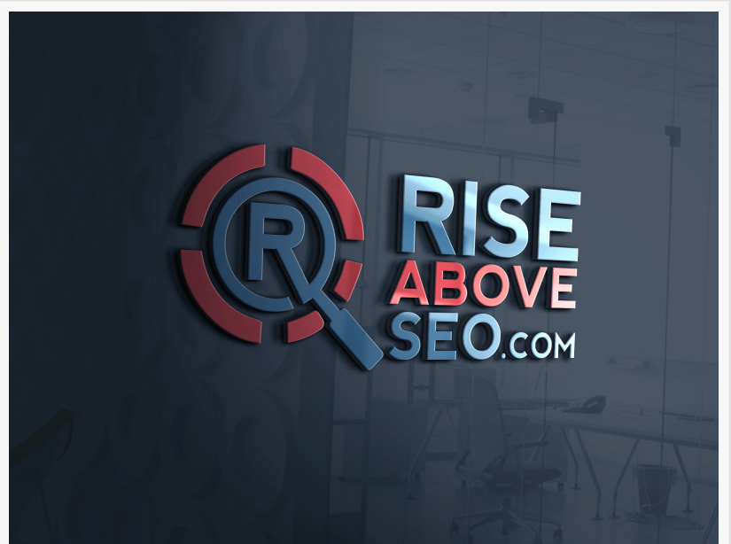
Rise Above SEO Logo

Google analyzes your profile, takes into account the accuracy of your details, and performance based on reviews to rank your profile. If it finds your profile is up to the mark, it will show your business when someone performs a relevant search.