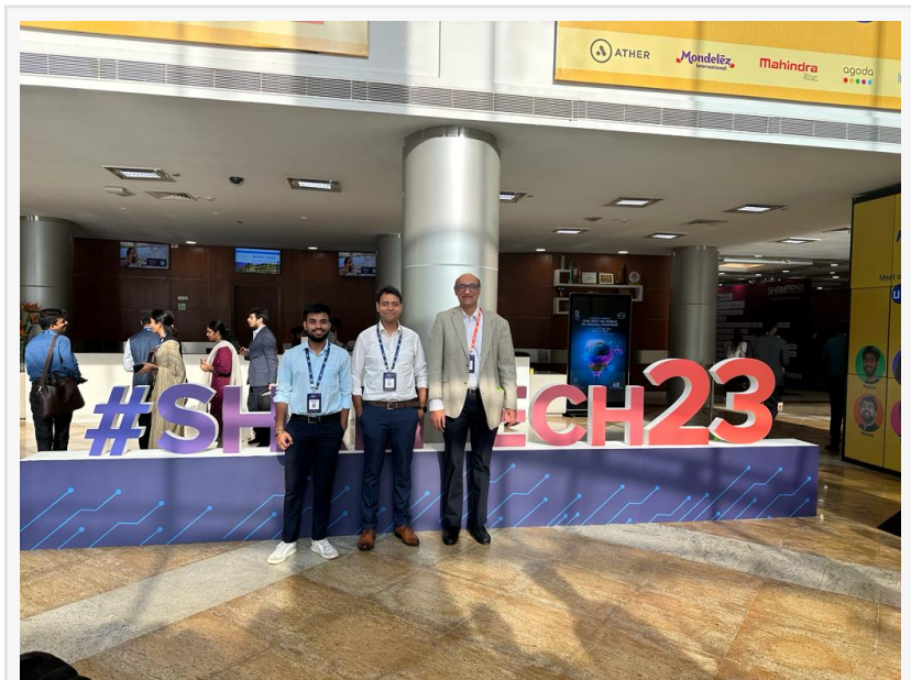
The ProHance team at #SHRMTECH 23