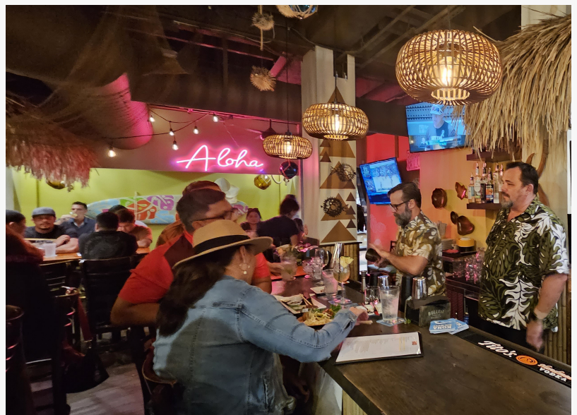
The Pupu House has been popular with locals and visitors since they soft opened at the end of April.

Aloha, e komo mai (Greetings, come inside)...hearken back to a simpler time when Waikiki was being discovered by travelers from around the world, Duke Kahanamoku and his Waikiki