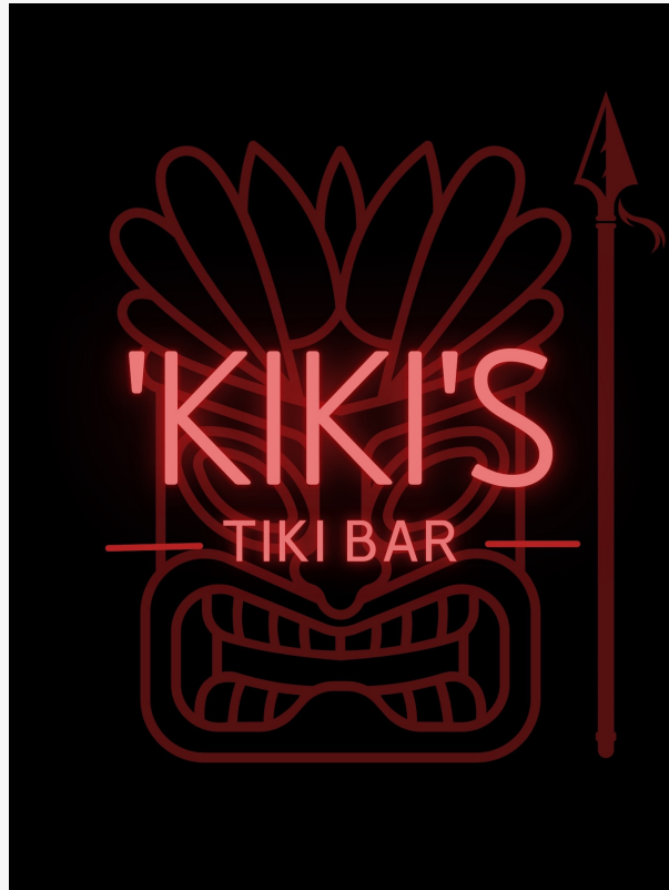
'Kiki's Tiki Bar logo