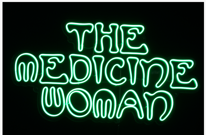
Medicine Woman LA 9058 Rose St. Bellflower, CA 90706