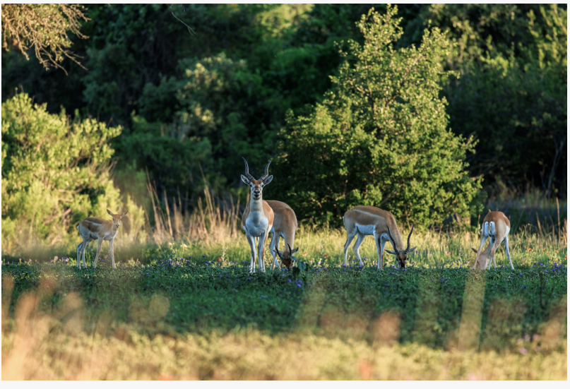
Across the grasslands and live oak tree lines, exotic wildlife roam throughout 464 Ranch.

experience in a community designed for quiet reflection and communal connection, with the vibrant amenities of Johnson City just down the road."