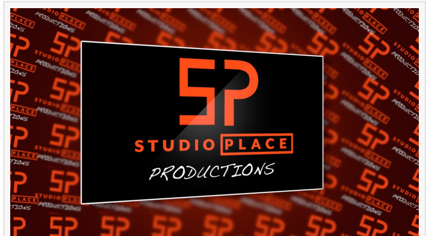
Studio Place Productions