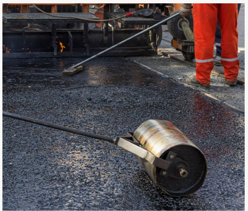
paving and seal coating for Arlington homeowner

Arlington Paving & Sealcoating is a locally owned and operated paving and seal coating company serving the Arlington, TX community for over 20 years. With a focus on customer service and satisfaction, the company offers a wide range of services, including new installations, repairs, maintenance, resurfacing, and seal coating for both residential and commercial properties. By using high-quality materials, state-of-the-art equipment, and experienced professionals, Arlington Paving & Sealcoating has established itself as a trusted provider of asphalt services in the area. In addition to their commitment to quality workmanship, the company is also