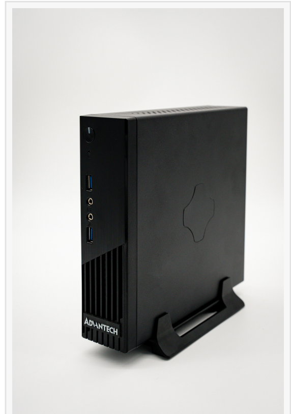
The new US-developed and manufactured Valor Mini Workstation provides a 7-year minimum lifespan

The flexible workstation comes with up to 64 GB DDR4 2933 RAM as well as an onboard M.2 2280 M-key slot for high-speed NVMe SSD. For low-cost storage, an optional 2.5" SATA HDD/SSD