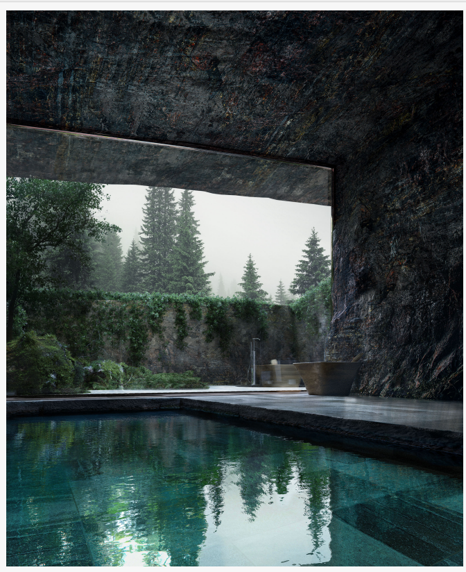
Bath house will be constructed from boulders and rock, designed to cut you off from the world and propel you into nature through its materials and design.

"We make clothes from the future, and Bjarke