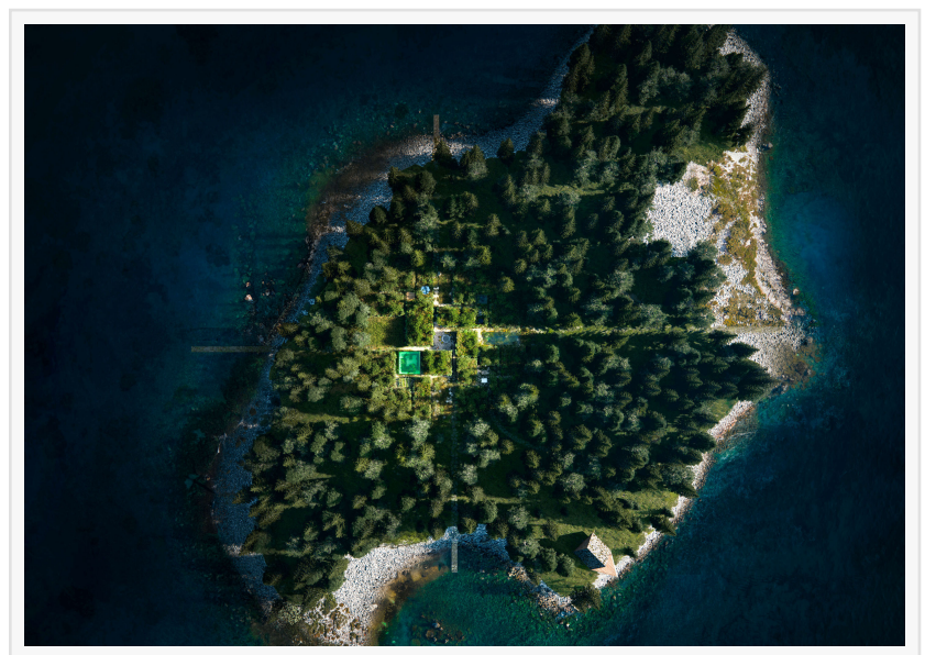
Aerial view of the nine main structures of Vollebak Island that will embed themselves into the environment, including the glass bricked vegetable and plant house that is made from emerald colored glass bricks

Island is set to be auctioned via <u>Sotheby's Concierge Auctions</u> in cooperation with Scott and Angie Bryant of Sotheby's International Realty Canada with an estimate of $5,000,000 to $10,000,000 USD. Bidding will open online on 8 June at conciergeauctions.com, and culminate live on 14 June at Sotheby's New York.