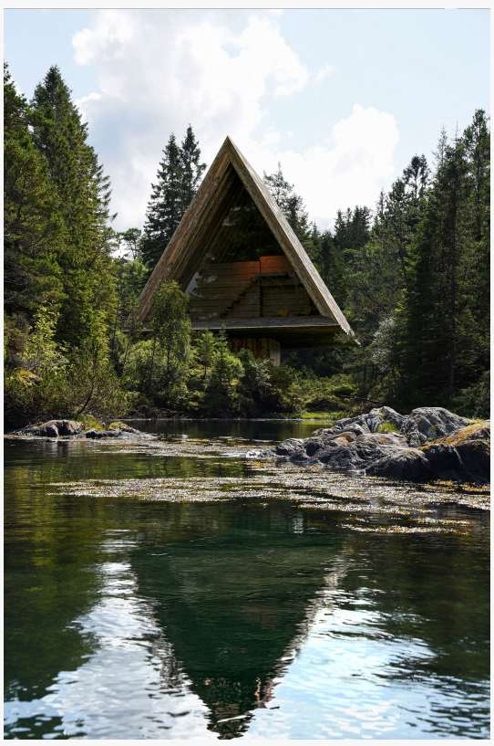
Wood house, a self contained house on the east shore of the island. The design has two bedrooms, a kitchen & a living area looking out through a vast 8m triangular vista.

"With Vollebak Island, we wanted to provide people with a glimpse of the future—a vision for how we might one day live on our planet—but one that can be built in real