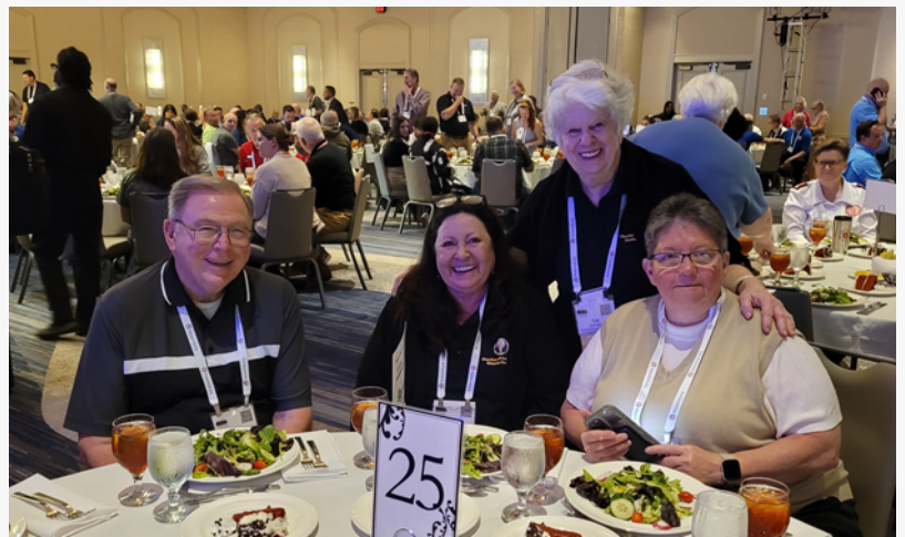
NVOAD members from Utah, Washington, DC, and West Virginia joining over 800 other attendees