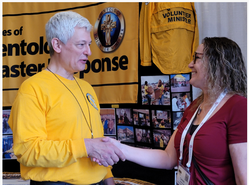
A Scientology Volunteer Minister greeting a guest at their booth