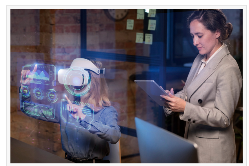
Generative AI in the HR

Furthermore, it may cover consumer behavior such as demographics, purchasing patterns and preferences