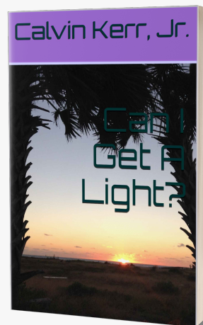
Can I Get A Light? Book