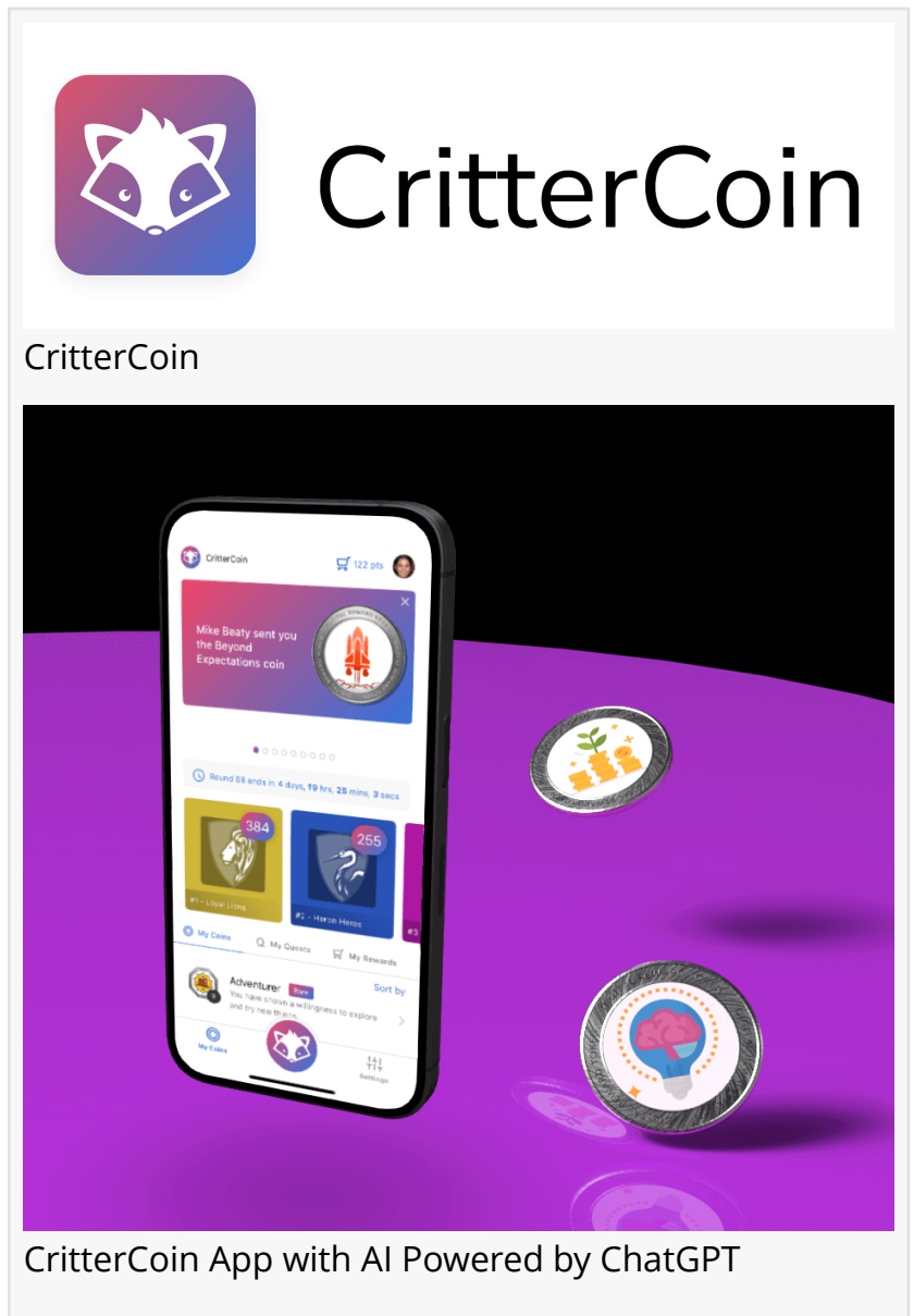
CritterCoin App with AI Powered by ChatGPT

This press release can be viewed online at: https://www.einpresswire.com/article/634478665 EIN Presswire's priority is source transparency. We do not allow opaque clients, and our editors try to be careful about weeding out false and misleading content. As a user, if you see something