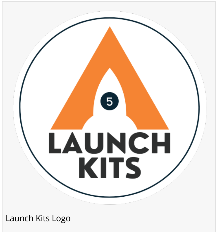
Launch Kits Logo

Launch Kits relies on a portfolio of custom-built, in-house website templates that have been optimized over years of experience with service businesses to rank well with search engines, convert visitors into customer leads, and make small businesses look great. Their approach