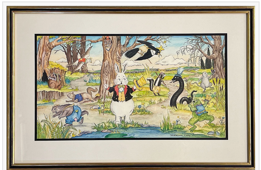
This sweet and colorful Harrison Cady watercolor and ink drawing of Peter Rabbit sold for $2,600 in Briggs Auction's January Peter Rabbit Collection auction.

This press release can be viewed online at: https://www.einpresswire.com/article/634508300