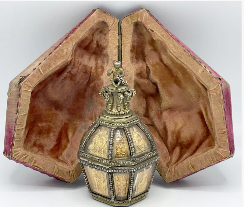
This fascinating Italian snuff box in brass and beveled glass, depicting various mythological scenes in a fitted velvet case sold for $7,000 in a February auction.