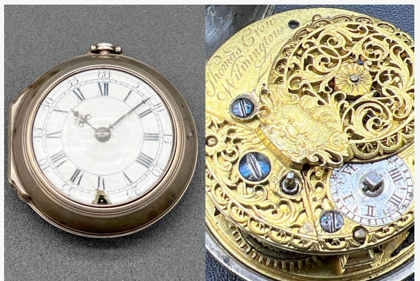
Rare 18th century Thomas Crow (Wilmington, Del.) signed pocket watch with fusée movement and enameled dial ($5,500).

GARNET VALLEY, PA, UNITED STATES, May 18, 2023 /EINPresswire.com/ -- A rare and important gilt bronze Tibetan Buddha blasted through its $200-$300 pre-sale estimate to finish at a staggering $200,000 in an online Fine Estates Auction held March 24th by Briggs Auction, Inc. The piece, pulled from a Main Line, Pennsylvania estate, generated auction fever from almost the moment it was posted until the hammer came down. It was the most ever paid for a single item at Briggs Auction, Inc.