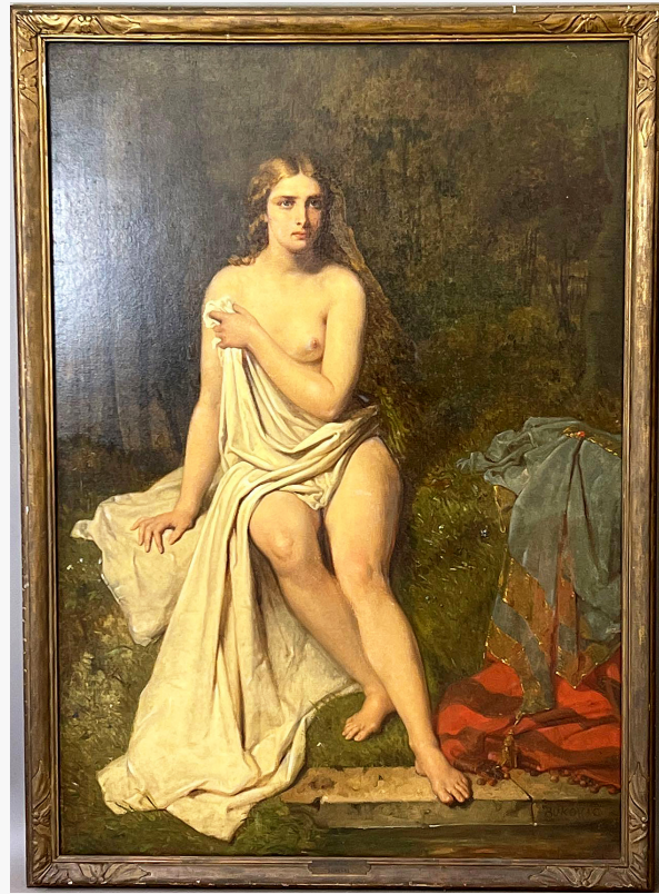
Large-format, nearly life-size oil on canvas portrait of a partially-clad beauty, titled Lorelei ($32,000).